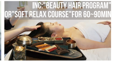
INC:"BEAUTY HAIR PROGRAM" OR "SOFT RELAX COURSE"FOR 60~90MIN