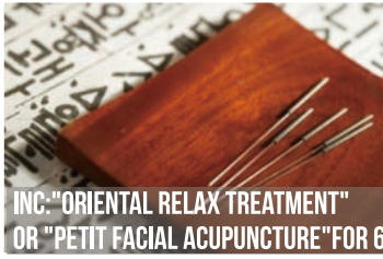
INC:"ORIENTAL RELAX TREATMENT" OR "PETIT FACIAL ACUPUNCTURE"FOR 60~90MIN